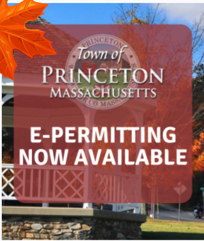
CLICK ABOVE PHOTO TO ACCESS WEBSITE

The Town of Princeton has gone live with online E-Permitting! This new online system will allow contractors and homeowners to apply for a variety of permits from their home, office, or mobile device.