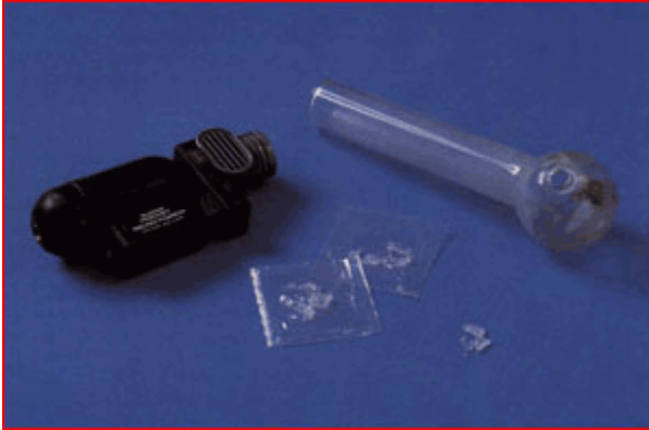
Ice and the pocket micro-torch, and the glass pipe used to smoke the drug.

Some law enforcement and treatment professionals see ice as a growing problem because of its purity and its immediate and intense effect, which may, depending on the dose, last from 2-14 hours. In addition, its use may become popular because the smoking of ice eliminates the use of a needle, thereby reducing the risk of AIDS and other blood diseases; while the low cost of production results in large profits for the dealers who sell ice and the clan lab operators who produce it.