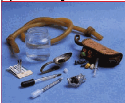
Black tar heroin and the paraphernalia for injecting and storing the drug

The most common use of heroin is by injection (called "mainlining" or "shooting"), but in its powder form it can be inhaled through the nose or smoked. Paraphernalia for injecting heroin include hypodermic needles, small cotton balls used to strain the drug, and water and spoons or bottle caps used for "cooking" or liquefying the heroin. Paraphernalia for inhaling or smoking heroin includes razor blades, straws, rolled dollar bills, and pipes. The high from the drug usually lasts from four to six hours.