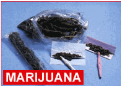
Marijuana is sold in plastic bags or in hand rolled cigarettes known as joints.

Following alcohol, marijuana is the second most popular drug with youth. It consists of the leaves, flowers, stems, and seeds of the cannabis plant, which are dried and chopped into small amounts. Marijuana can also be found as Sinsemilla, the potent flowering tops of the female marijuana plant.