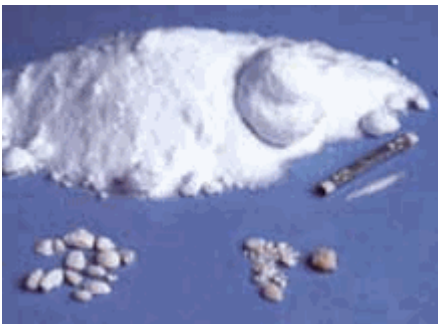
Powdered cocaine and its derivatives, rock and crack.

Cocaine is produced as a white chunky powder and is often called coke, blow, white, snow, snort, flake, nose candy, hubba, or cane. It is said most often in aluminum foil, plastic or paper packets, or small vials. Cocaine is usually chopped into a fine powder with a razor blade on a small mirror or some other hard surface, arranged into small rows called "lines," then quickly inhaled (or "snorted") through the nose with a short straw or rolled up paper money. It can also be injected into the blood stream.