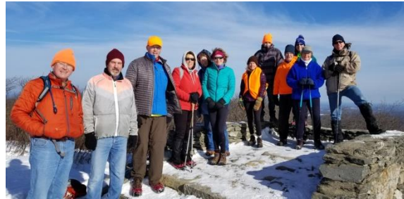
November 2018 Hike up Mt Wachusett

The Princeton OSC is also working to expand the network of trails and the trail connections in town, to build the “Trails Around Princeton” (TAP) so that there are good avenues for walking between town areas. People who wish to help with this effort can also call or eMail.