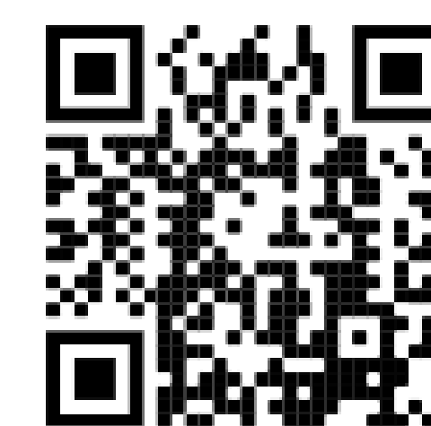
Princeton Land Trust