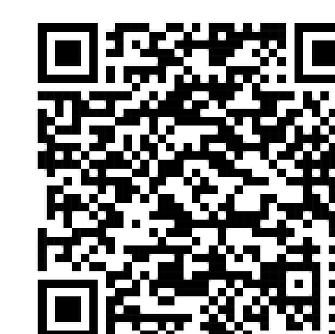
Bullock McElroy Trail