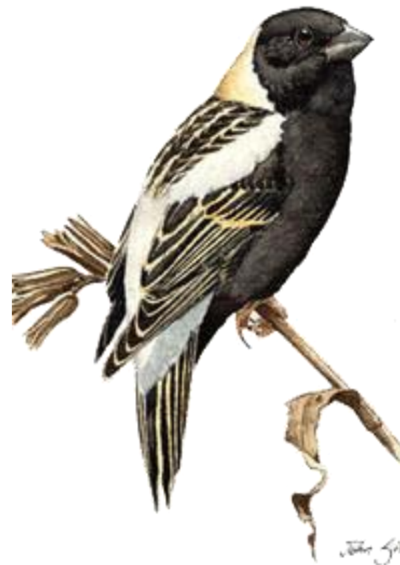
Bobolink Dolichonyx oryzivorus