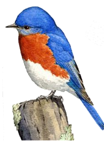
Eastern Bluebird Sialia sialis

Some of the bird species you might see or hear in these fields are: