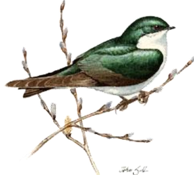
Tree Swallow Tachycineta bicolor