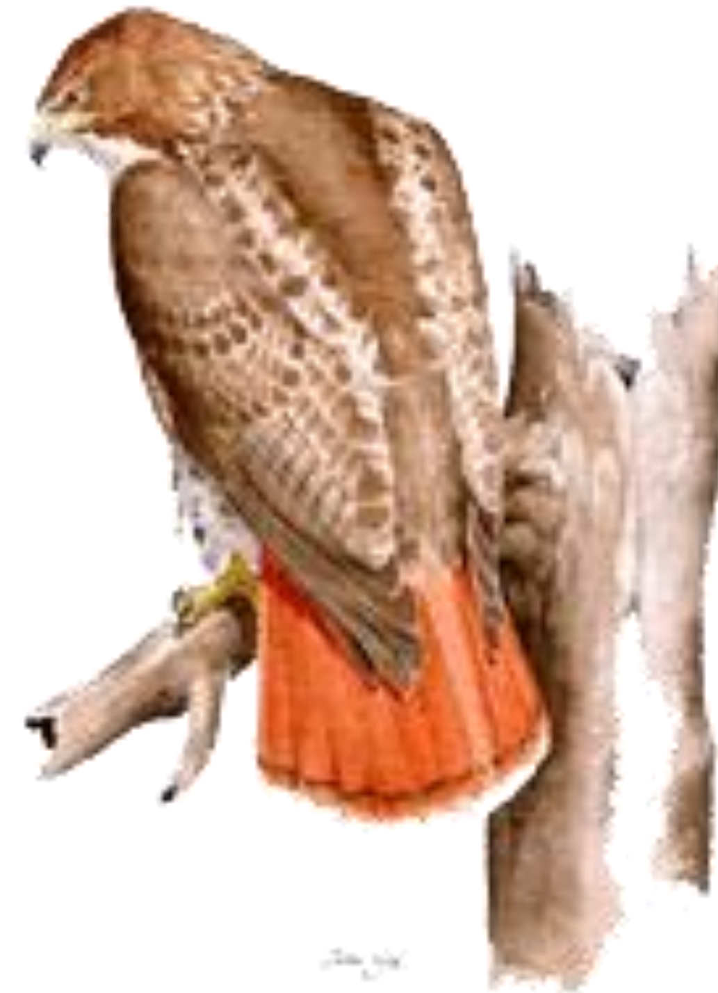
Red-tailed Hawk Buteo jamaicensis