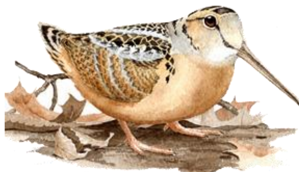
American Woodcock Scolopax minor