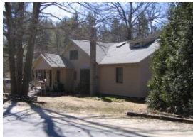
219 Ball Hill Road Historical Name: Earl Henry House C. 1950 House history researched by the Princeton Historical Commission 2006